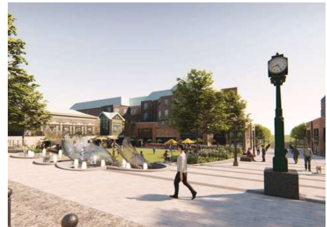
RENDERINGS OF PROPOSED TOWNE SQUARE REVITALIZATION (NAK DESIGN STRATEGIES)